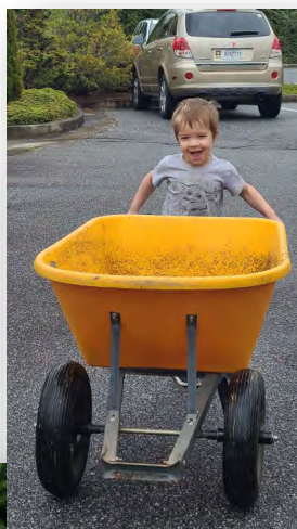
A fun Parish Clean Up Day on April 16